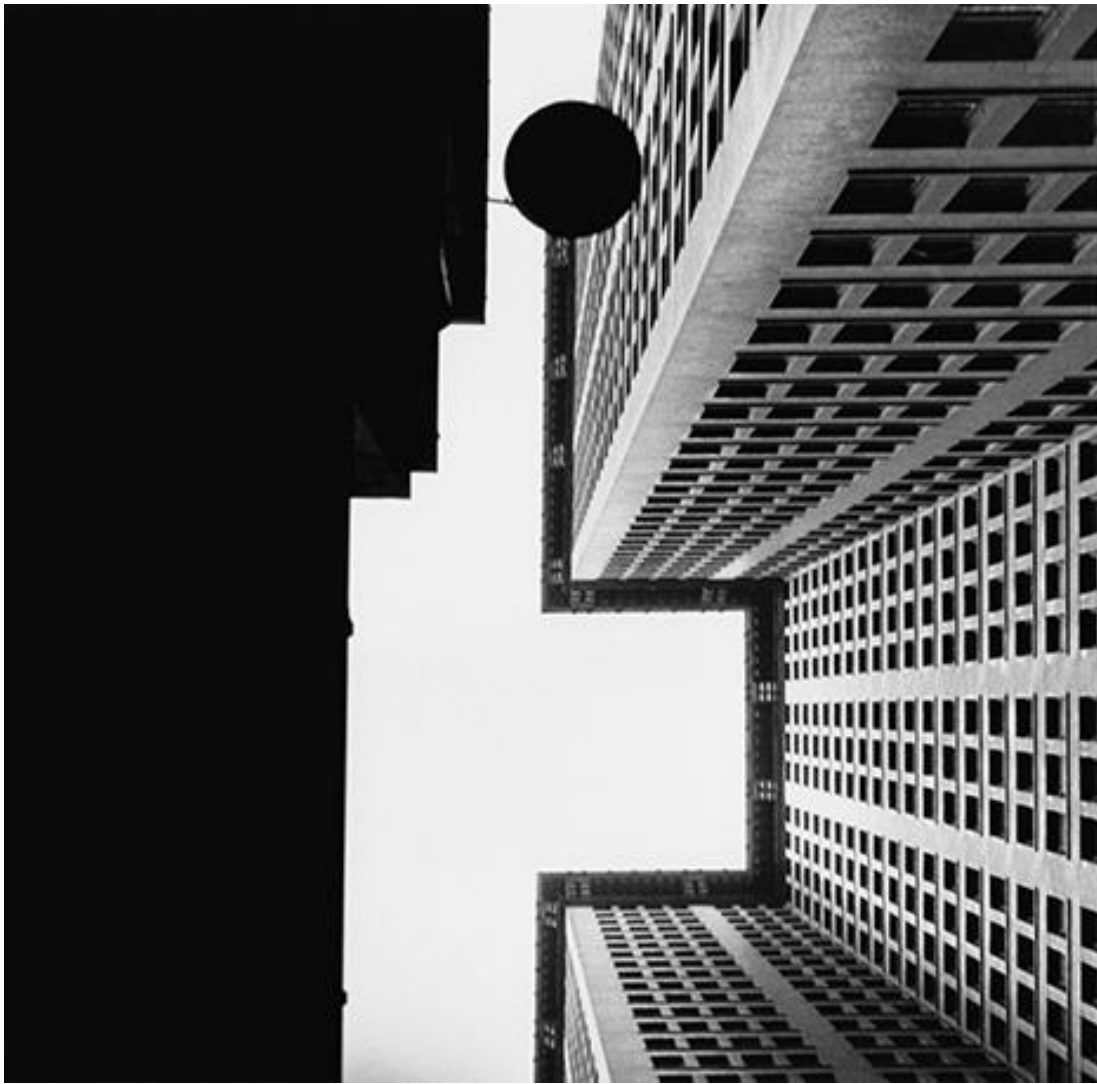
Chase National Bank, New York, 1928 Gelatin silver print