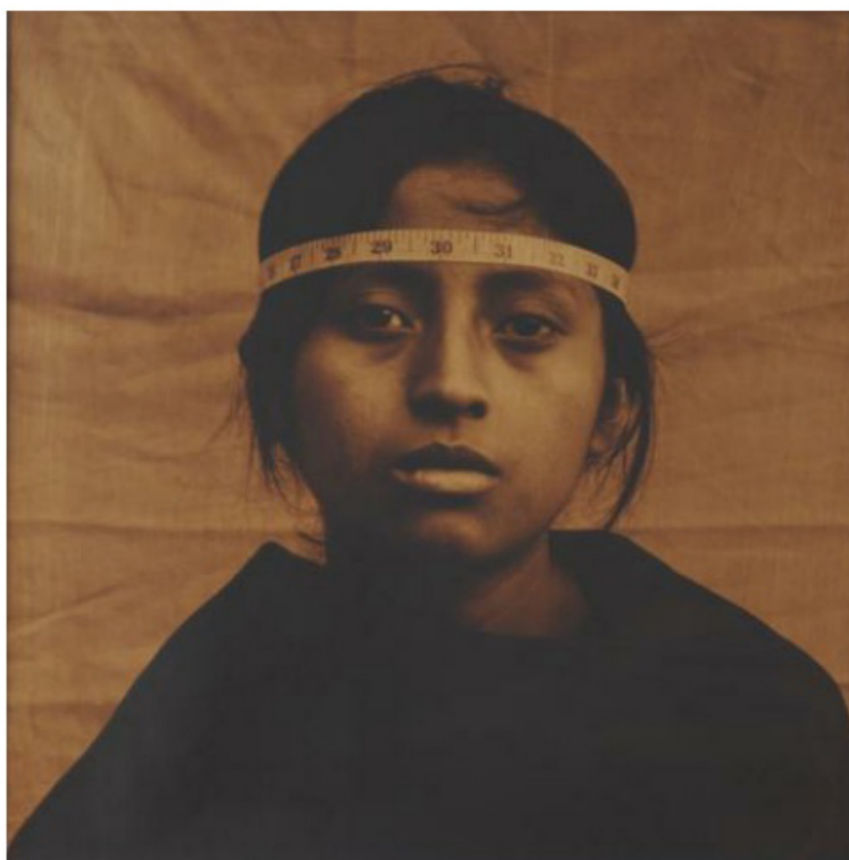
Luis González Palma (b. 1957) La Mirada Crítica (The Critical Stare) , 1998

Please visit our website to view our current exhibition