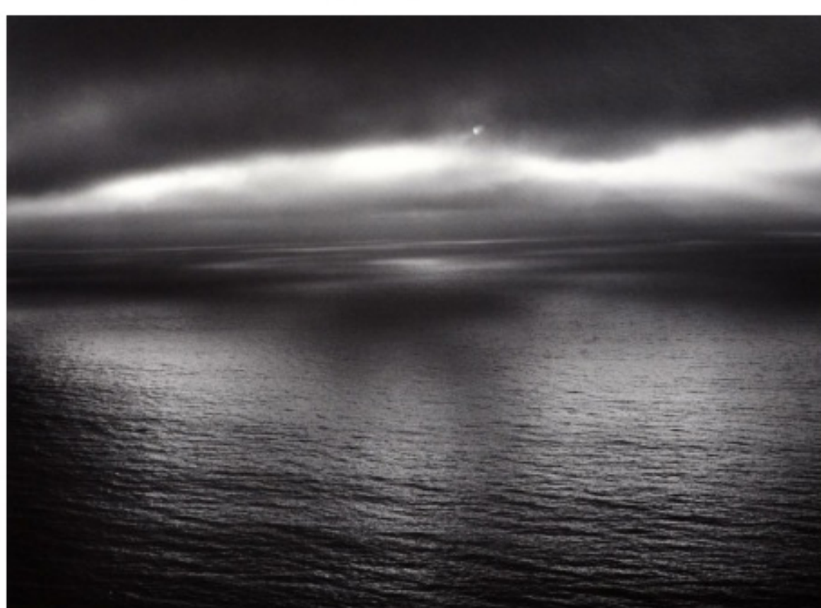
Minor White (1908 - 1976) Sun Over the Pacific, Devil's Slide , 1947