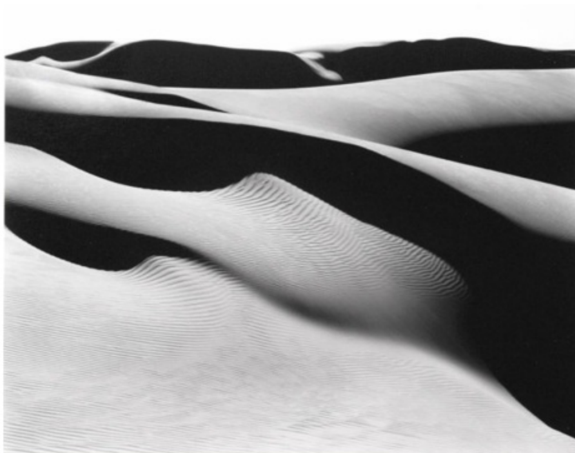
Edward Weston (1886 - 1958) Oceano , 1936