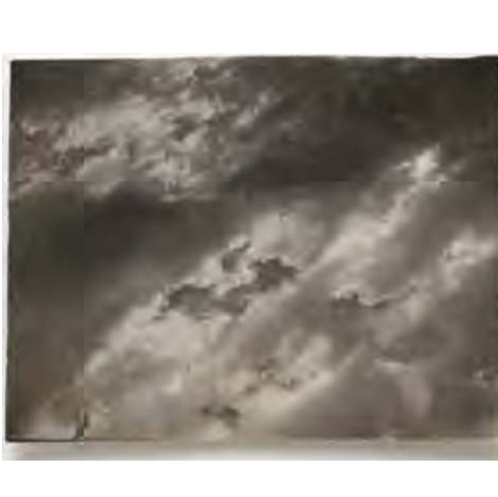
Beaumont Newhall (1908 - 1993) Egypt (Clouds-diplych) , 1944 Vintage gelatin silver prints Images: 1 1/4 x 1 1/2"