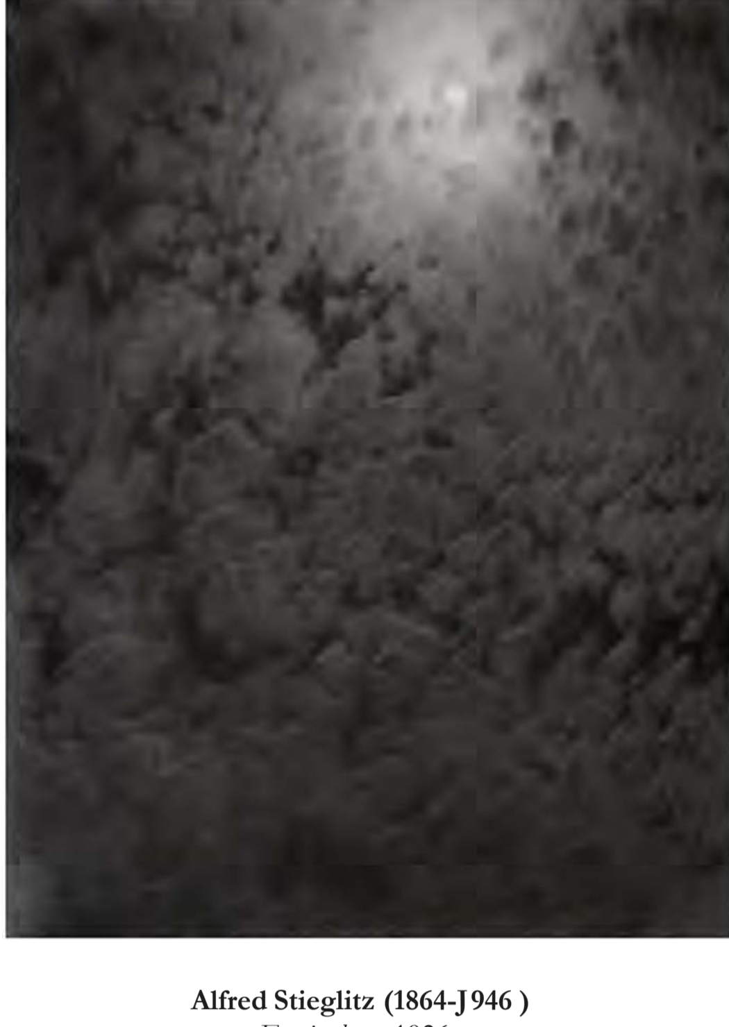
Alfred Stieglitz (1864-1946) Equivalent , 1926 Vintage gelatin silver print Image/Mount: 4 5/8 x 3 5/8"; Secondary mount: 13 1/2 x 10 5/8"