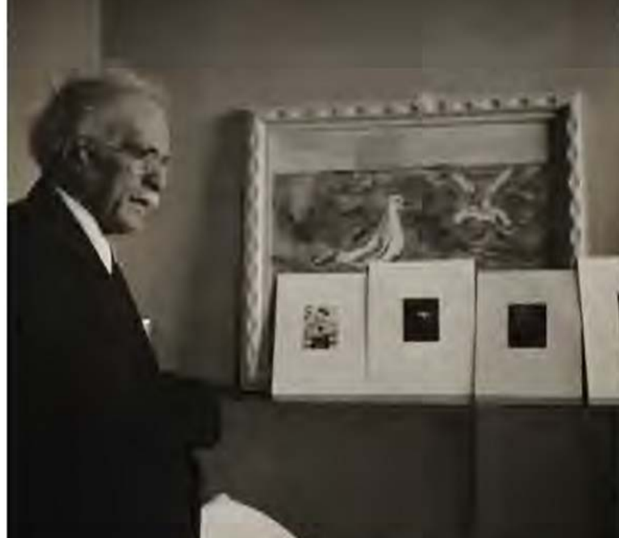
Nancy Newhall (1908 - 1974) Alfred Stieglitz and Equivalents at an American Place , 1943 Vintage gelatin silver print Image: 2 5/16 x 2 1/8"; Paper: 3 15/16 x 2 3/8"