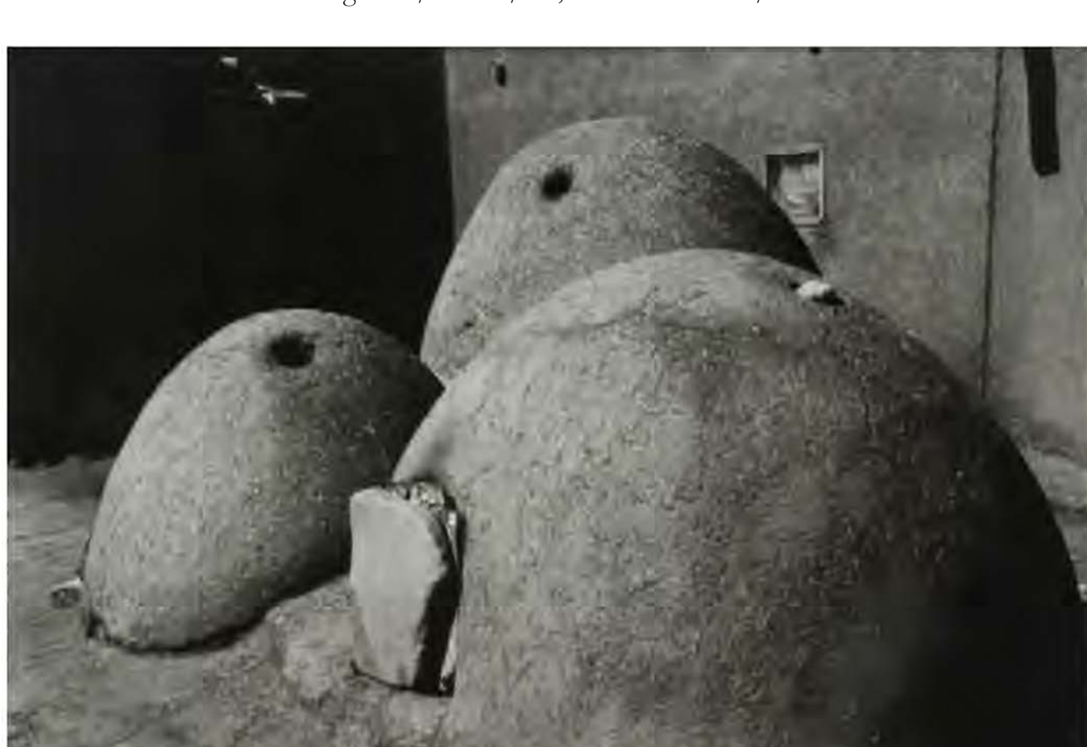
V. Villiard Van Dyke (1906-1986) Taos Pueblo Ovens , 1933 Gelatin silver print Image: 7 1/2 x 9 1/2"; Mount: 14 x 16 3/4"

We have updated our website and created a section for Works by Various Artists . This page includes a wonderful variety of photographs. We will be posting new inventory on this page as it arrives at the gallery.